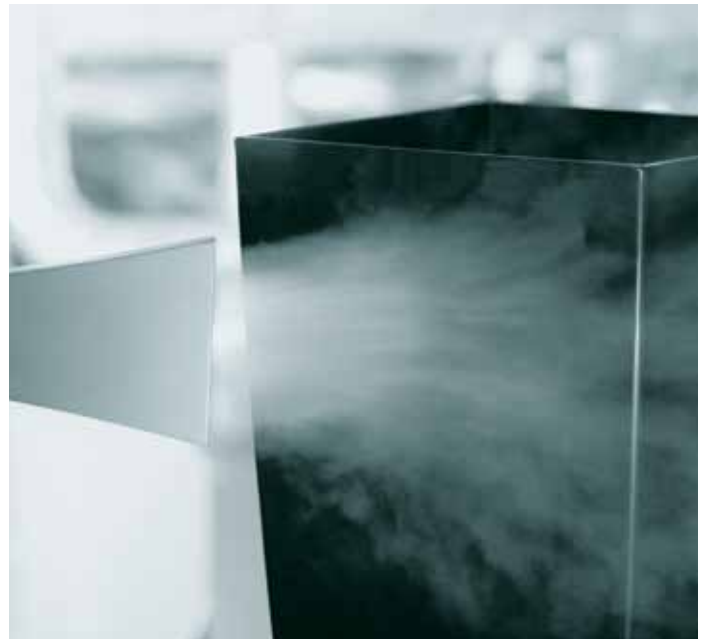
Cleaning treatment of LECHUZA® garden planters with CRYOCLEAN snow prior to painting