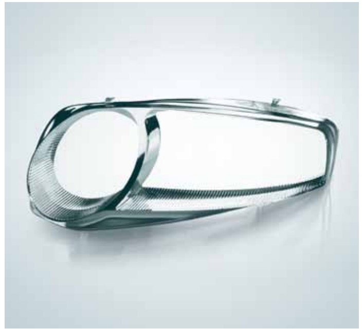
Car headlight housing produced using PLASTINUM Temp S technology