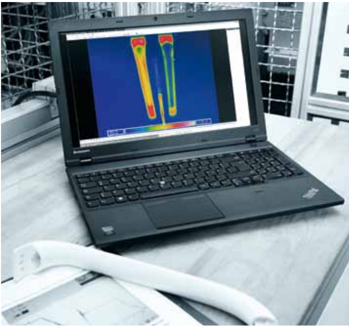
Infrared picture shows the temperature of a refrigerator handle 16 seconds after opening the mould. With carbon dioxide (right), the part cools down faster than with nitrogen (left).