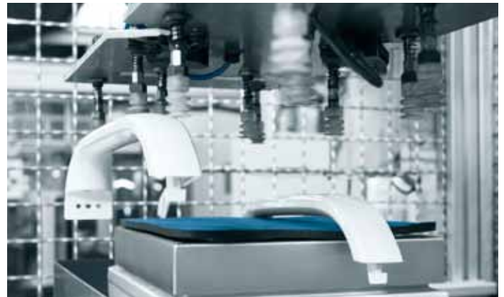
Quality control of refrigerator handles confirms the high process reliability of PLASTINUM GIM C.

For more information, please visit www.linde-gas.com/plastinum or send an email to plastics.rubber.team@linde.com