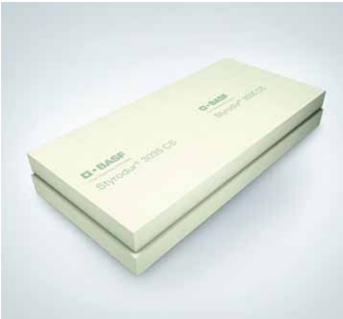
Extruded polystyrene boards produced using PLASTINUM Foam E technology