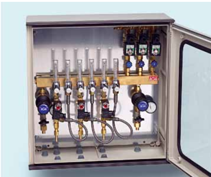
The photo above shows a cabinet for three tanks with operating oxygen and emergency oxygen. This cabinet is shown with a separate pressure regulator for emergency oxygenation.