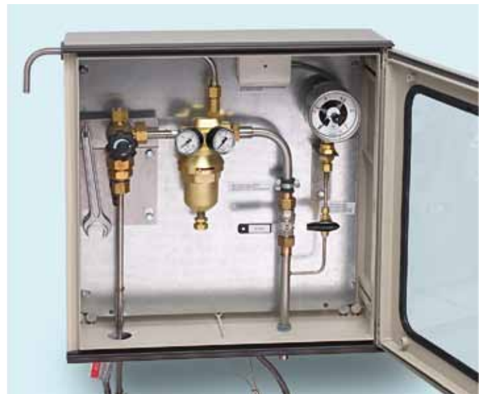
Back-up cabinet: this dosing cabinet ensures that oxygen is supplied from cylinders or cylinder bundles in case of interruption of liquid oxygen supply.