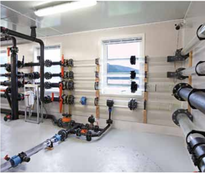
Transparent pipework to visualise optimum gas dissolution

equipment to perform environmental analyses as well as field measurements. We are therefore well equipped to work with aquaculture customers and are conducting experiments in order to optimise solutions by replicating typical conditions existing on a fish farm.