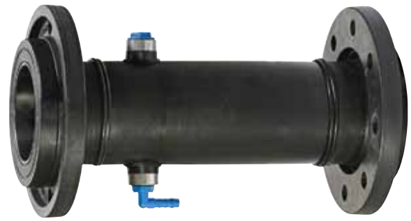
SOLVOX ® A 54