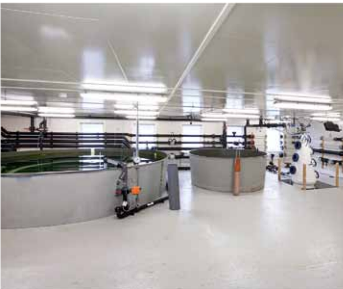
Technical hall with fish tanks and gas-dissolving equipment