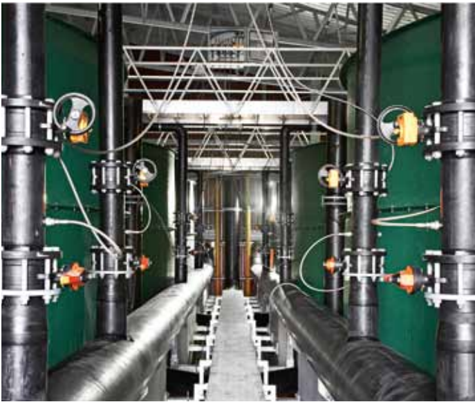
SOLVOX ® A installation

Linde's SOLVOX ® product line offers a wide range of oxygenation systems for the aquaculture industry. The SOLVOX ® family comprises equipment for optimised dissolution of oxygen in water, perfect distribution of oxygenated water to the fish and a regulation concept for smooth and reliable operation. With the SOLVOX ® equipment, we can serve all types of aquaculture installations.