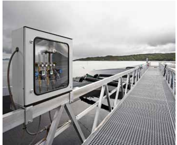
Control cabinet installation on a fish farm site.