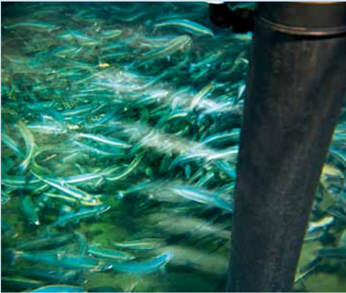
SOLVOX®Stream application in a fish tank